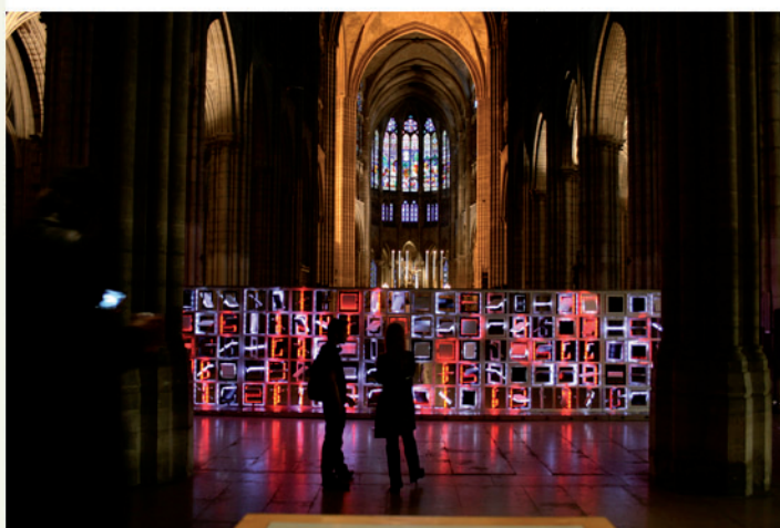
'Framework f5x5x5' by LAB[au]

Recently, after two years of work, the Brussels-based LAB[au] exhibited 'Framework f5x5x5', a 2x10m generative and interactive kinetic display, at the Basilique de Saint-Denis in Paris. The sensoric installation consists of a aluminium-plexiglas-structure which is illuminated by 6750 LEDs.