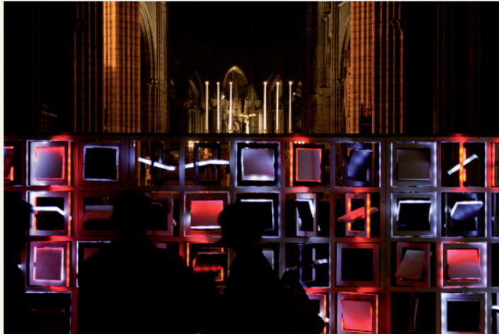
'Framework 5x5x5' by LAB[au]

"The project title refers to informatics' modular workspace, called a framework. Here, '5x5' frames constitute the framework a space built up by five modules of 2x2m, divided in 5x5 squared elements, establishing a matrix of 5x5x5 = 125 modules. At the one side diffusing the light (white) and at the other side absorbing the light (black), the modules constitute a binary language (0,1) and a space of 125 pixels, allowing to transcribe captured data from the physical environment in a kinetic and luminous play _ in between opening and closing, in between transparency and reflection, in between light and dark."